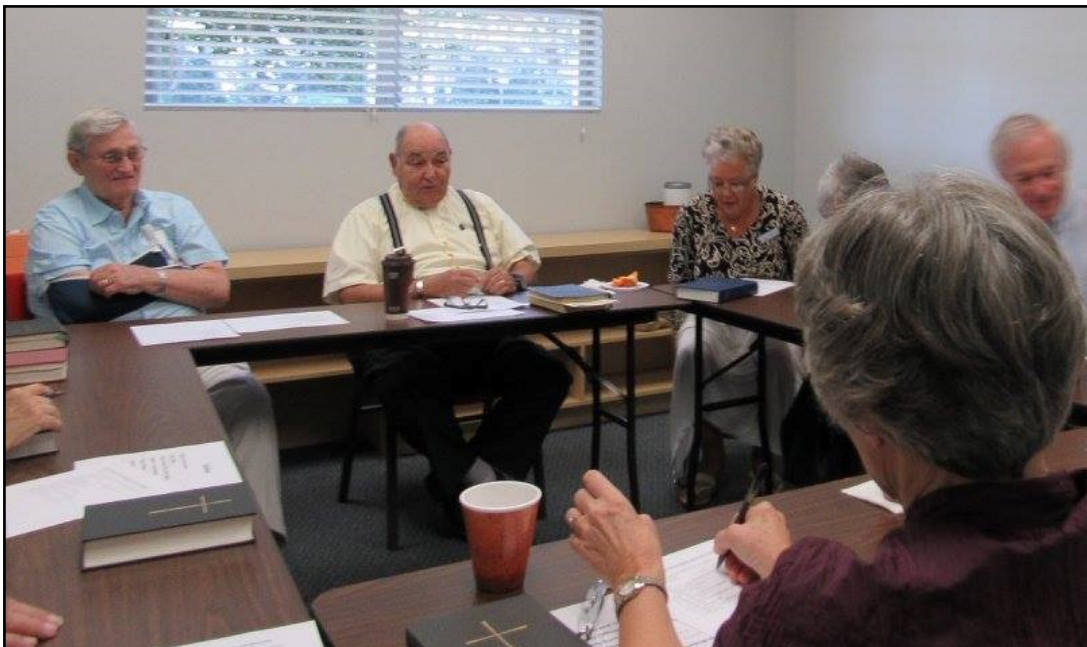
Adult education class on a Sunday morning

Sunday morning classes for adults vary in topic, and new ones are offered throughout the year. There is also a time of discussion and study during The Gathering on Wednesday nights. Throughout the year, the following study groups also meet either periodically or on an ongoing basis: Adventures in Faith & Science class, bereavement group, Centering Prayer, home groups, men's bible study, and women's bible study. Adults are also invited to be a part of Cursillo, which is offered through the diocese several times a year.