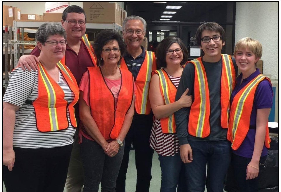
Members helping in the community at election equipment drop sites

We have focused on the experiences of newcomers to Holy Innocents'. How do we make them feel welcome? Help them navigate the sometimes-confusing liturgy? Get them plugged in and connected? We have learned that it takes the community of our church, not just the greeters at the front door, to fully integrate our newcomers. This is an evolving process at Holy Innocents', and one to which we are truly committed in order to be a transformative church.