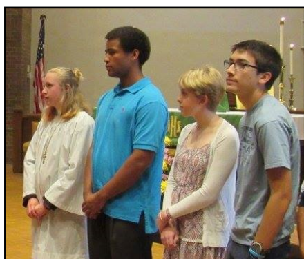
Youth on Education Sunday

Sunday morning classes for youth also vary in topic from week to week. Youth group meets on Wednesday evenings at 7:00 during The Gathering to discuss a variety of subjects as they relate to faith. The youth also participate in a variety of mission projects throughout the year, including THORN ministries (feeding the homeless in Tampa) and an annual Christmas party where the gifts are not for each other, but for a crisis pregnancy center in the area. The youth group holds a number of fellowship opportunities too, including an annual trip to Orlando for Rock the Universe at Universal Studios and several lock-ins. Youth also volunteer as helpers during Young People's Worship on Sunday mornings and during Vacation Bible School in the summer. Youth are also invited to participate in New Beginnings (grades 6-8) and Happening (grades 9-12) retreats offered by the diocese.