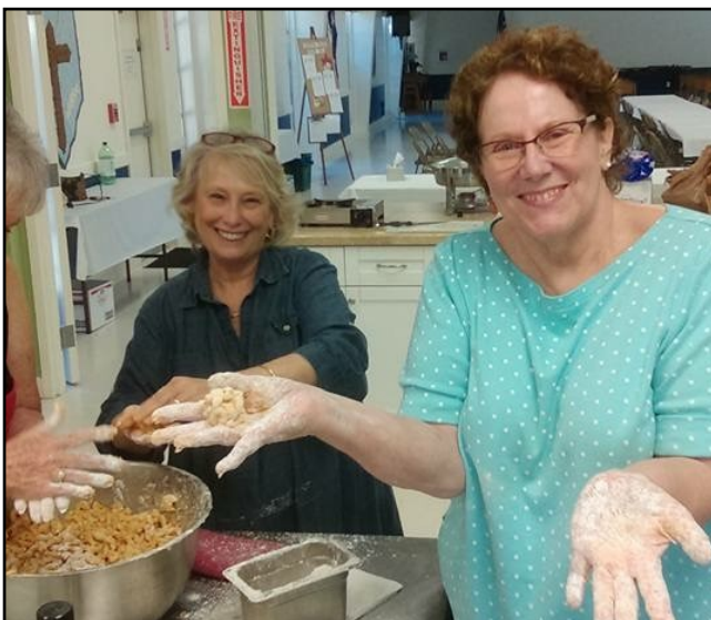
Preparing Soup for the St. Lawrence Guild

Greeting Card Ministry Healing Ministry Helping Hands Hospital Visitation Lay Eucharistic Visitors New Moms Helpers Parish Prayer Chain Prayer Ministry St. Lawrence Guild