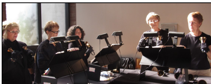
Holy Innocents' Bell Choir