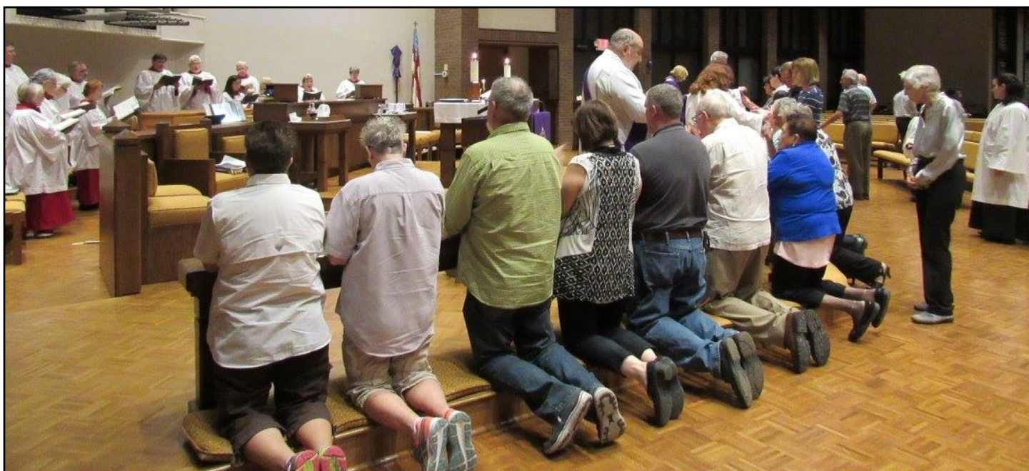
Worship on Maundy Thursday

We also offer a worship service at noon on Wednesdays in our chapel. This is a full service, complete with prayer, scripture, homily, canticles, and Holy Eucharist.