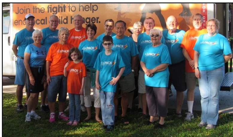
Volunteers with KidsPACK