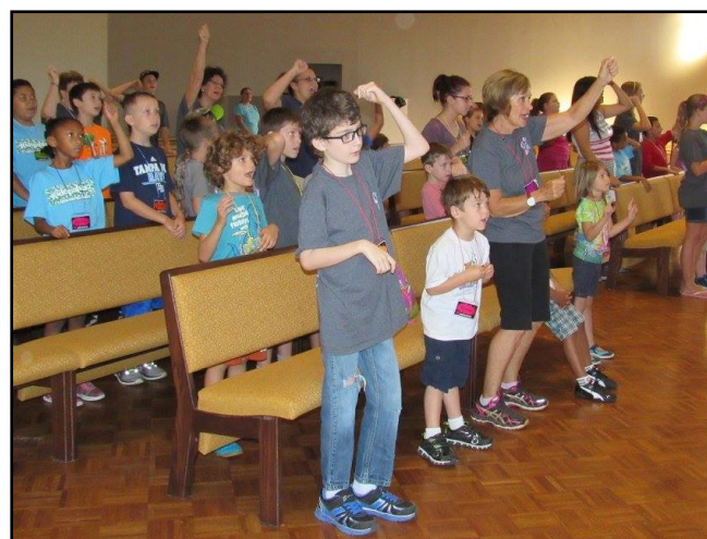
Vacation Bible School