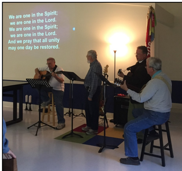
"The Gathering" praise band

On Wednesday evenings, we meet in the Parish Hall for The Gathering, a time of food, fellowship, worship, praise singing, prayer, and discussion. This service meets through the school year and breaks for the summer months. We start The Gathering at 6:00 p.m. with a simple supper, which is followed at 6:45 by a less formal time of worship and prayer. Beginning at 7:00, the youth group convenes in the youth room and children ranging from age 4-grade 5 participate in Children's Prayer and Praise in Kiser Hall. The adults remain in the Parish Hall for a time of teaching and sharing. This is a wonderful worship and fellowship experience for the whole family.