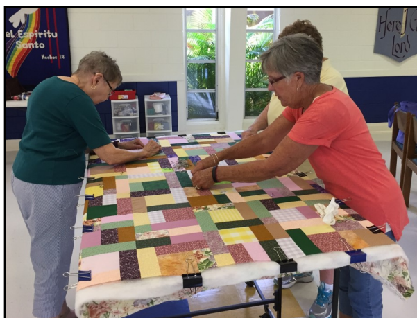
Making quilts for Rachel's Guild