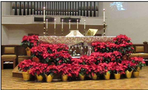
The altar at Christmas