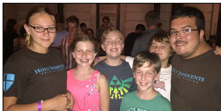
Youth at Rock the Universe