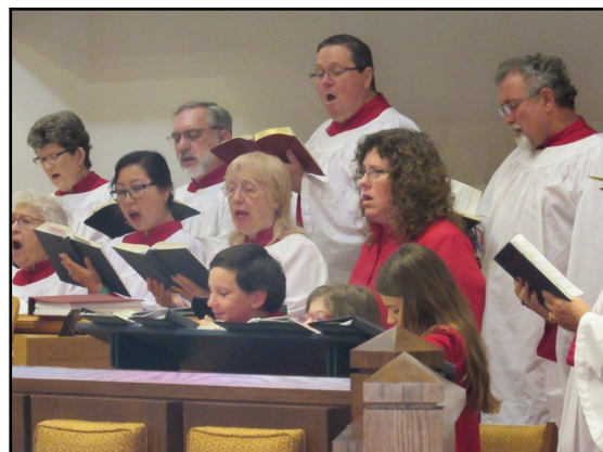
Holy Innocents' Parish Choir