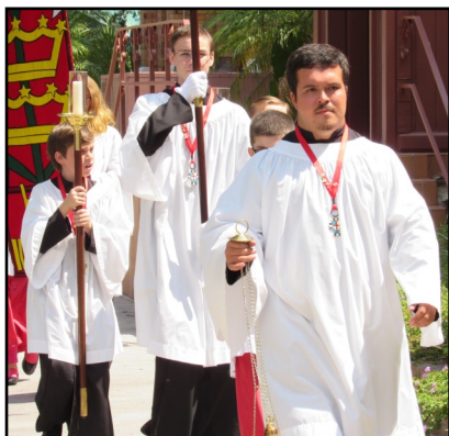
Some of our acolytes

"Where two or three are gathered in my Name, I will be in the midst of them." Jesus of Nazareth