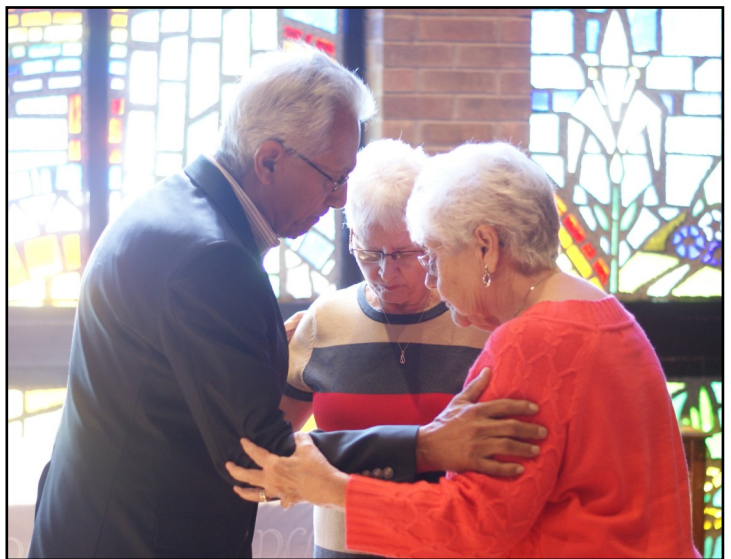
Prayer Ministry during Worship