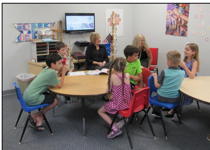
Children's Christian Education on a Sunday morning

The children use the popular Holy Moly curriculum on Sunday mornings, which teaches bible stories through scripture, crafts, and cartoons. On Sundays during the 10:30 service, children are invited to participate in Young People's Worship where they hear scripture, watch puppet shows, pray and sing together, and are introduced to the teachings of God on an age-appropriate level. Young People's Worship is led by our Rector Emeritus, a deacon, and several volunteers. During The Gathering on Wednesday nights, the children meet starting at 7:00 for St. Nicholas Children's Choir practice. We also hold an annual Vacation Bible School for children in our church and the surrounding community.