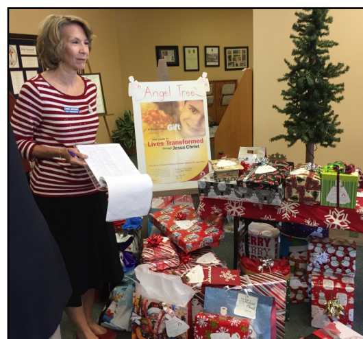
Gifts for Angel Tree Prison Outreach

Dominican Republic Mission Trips Nets for Life