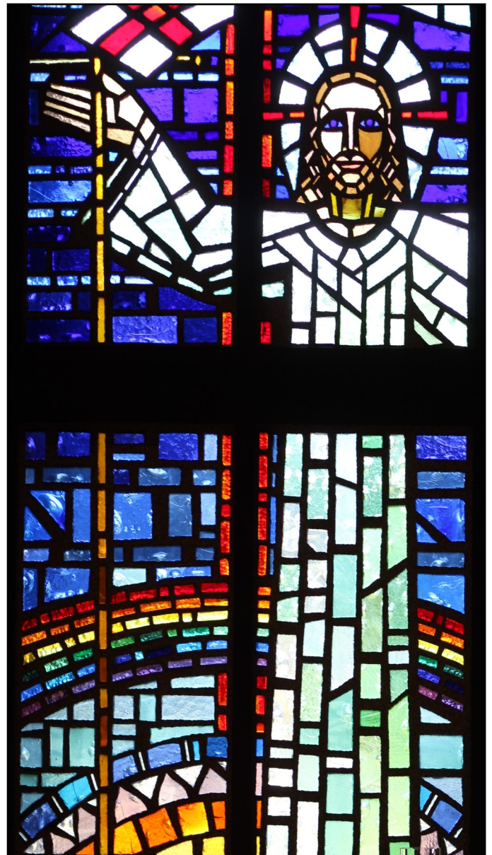
Good Shepherd stained glass window in the chapel

We developed a master plan for the renovation and future expansion of our facilities in 2012. We completed the first phase of the plan with the renovation of Kiser Hall and the Parish Hall in early 2016. Most of the construction labor was accomplished by Holy Innocents' volunteers, involving well over 100 people during this period. On one memorable day, about 80 people came to plant over 60 bushes and trees in six hours.