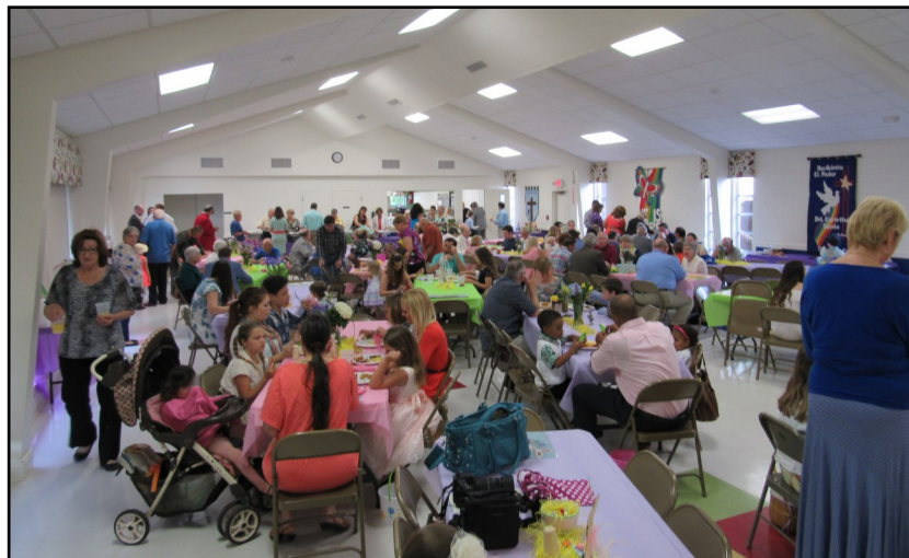
Hosting a fellowship event in our newly-renovated Parish Hall

Holy Innocents' has 11 members who form our Vestry. Elected to three-year terms during our annual meeting, the Vestry provides the support for our parish and programs. The rector appoints a Senior Warden; the Vestry elects a Junior Warden, Treasurer, and Vestry Secretary.