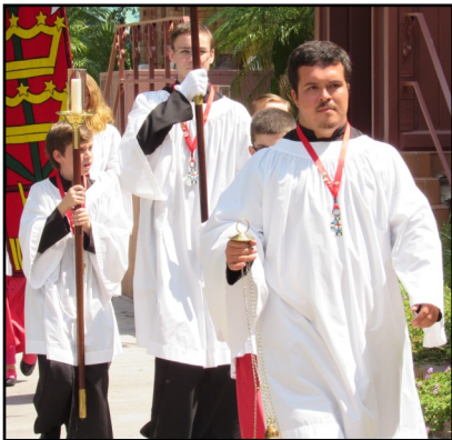
Some of our acolytes

"Where two or three are gathered in my Name, I will be in the midst of them." Jesus of Nazareth