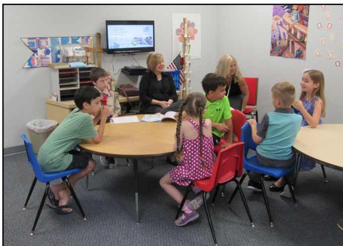
Children's Christian Education on a Sunday morning

The children use the popular Holy Moly curriculum on Sunday mornings, which teaches bible stories through scripture, crafts, and cartoons. On Sundays during the 10:30 service, children are invited to participate in Young People's Worship where they hear scripture, watch puppet shows, pray and sing together, and are introduced to the teachings of God on an age-appropriate level. Young People's Worship is led by our Rector Emeritus, a deacon, and several volunteers. During The Gathering on Wednesday nights, the children meet starting at 7:00 for St. Nicholas Children's Choir practice. We also hold an annual Vacation Bible School for children in our church and the surrounding community.