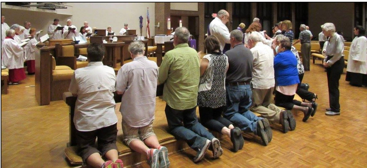
Worship on Maundy Thursday

We also offer a worship service at noon on Wednesdays in our chapel. This is a full service, complete with prayer, scripture, homily, canticles, and Holy Eucharist.