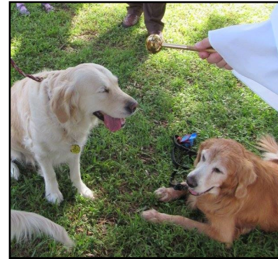
Blessing of the Pets