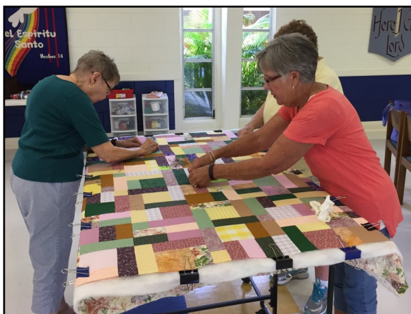
Making quilts for Rachel's Guild